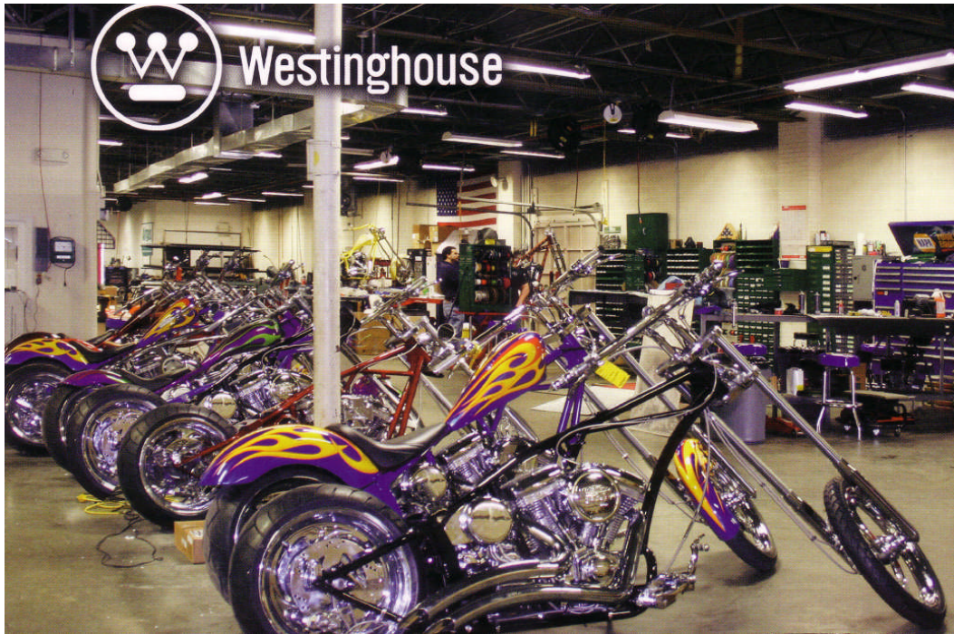
ORANGE COUNTY CHOPPERS Montgomery, New York