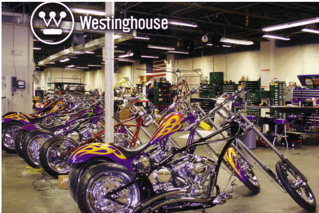
ORANGE COUNTY CHOPPERS Montgomery, New York